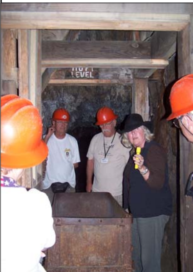
Checking out the mine