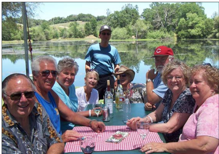
SoCal enjoying a little wine tasting