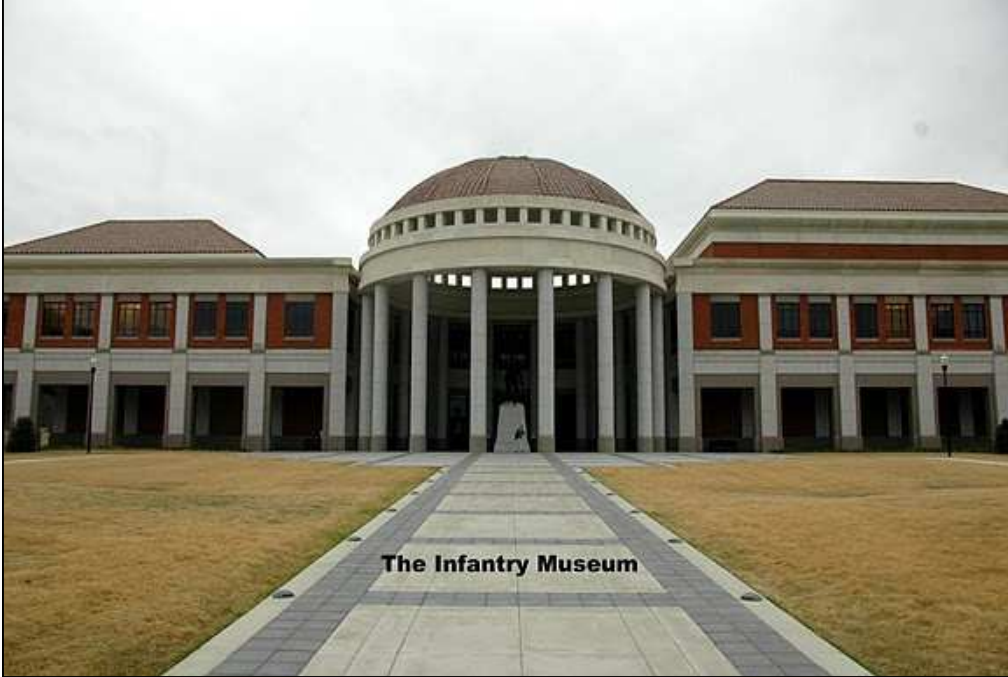
The Infantry Museum