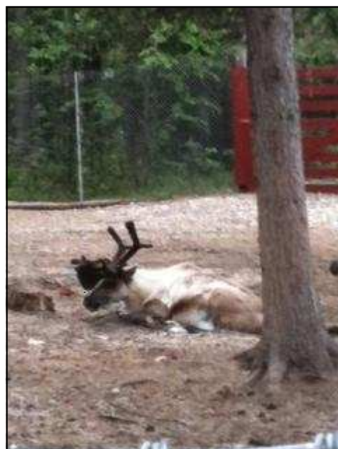
Even Reindeer get vacation

Did you know there really is a North Pole AK and Santa and his reindeer do live here? Check out the picture of Rudolph on vacation.